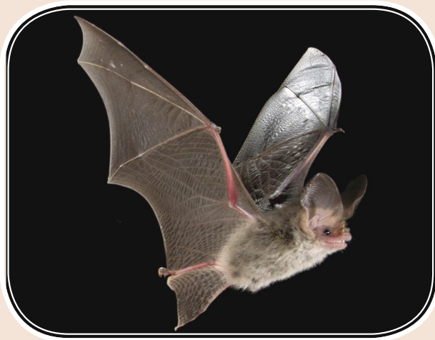
The Lesser Long-eared Bat ( Nyctophilus geoffroyi ) is a common species found roosting in buildings.