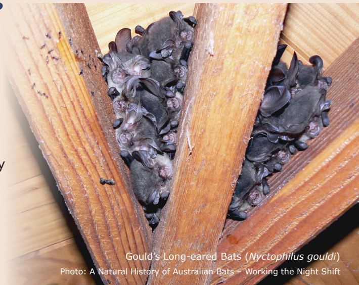
Gould's Long-eared Bats ( Nyctophilus gouldi )