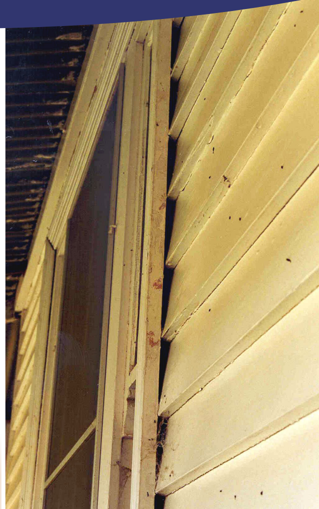
A colony of bats roosted behind the window frame, leaving the tell-tale sign of droppings on the wall.

Do the crumble test! Roll a dry dropping in a piece of tissue between your finger and thumb - if it feels hard then you probably have mice, not microbats. A microbat dropping will crumble quite easily - this is because it is made up of insect parts from its dinner the night before!