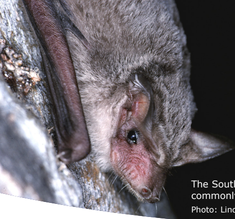
The Southern Free-tailed Bat ( Mormopterus planiceps ) commonly roosts in buildings